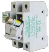
LPSM / LPHV Touch-Safe Fuseholders