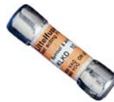
KLKD Midget Fuse