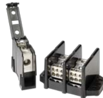
Power Distribution Blocks