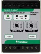
PGR-2601 DC Ground-Fault Relay