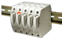
Up-LINK™ Remote Indication Fuseholder