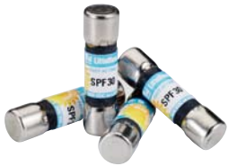
SPF Solar Rated Fuse

may not know is the breadth of products that Littelfuse has to offer. These products are specifically designed to increase safety to personnel and improve energy production uptime for the PV industry. These products are UL Listed or Recognized.