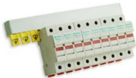
LPSM Fuseholder Busbar